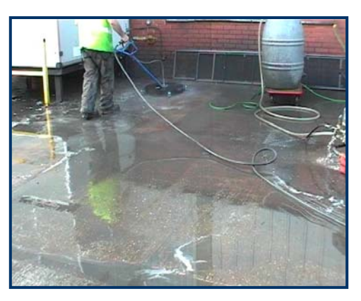
Cleaning by pressure washer