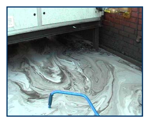
After the initial clean, the FleetKleen was left for and additional 15 minutes to unblock the oily drains