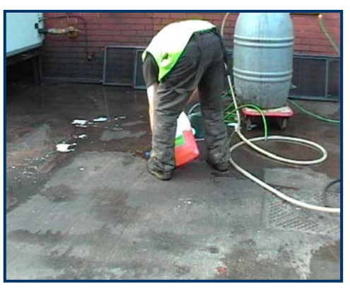
FleetKleen is diluted at 20:1