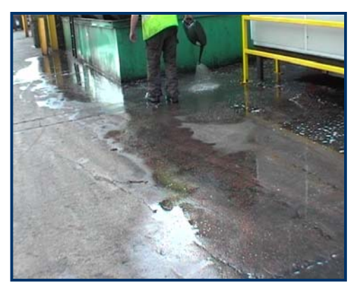
FleetKleen is applied and left to soak for up to 25 minutes