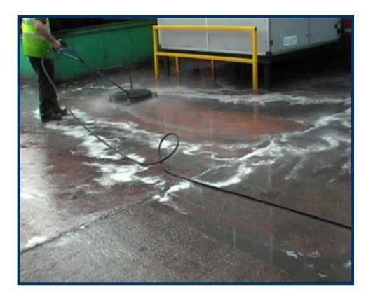
Cleaning by pressure washer