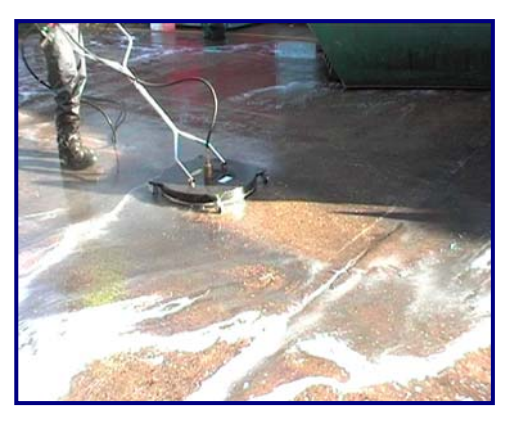
Pressure washer cleaning