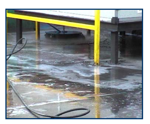
Cleaning by pressure washer