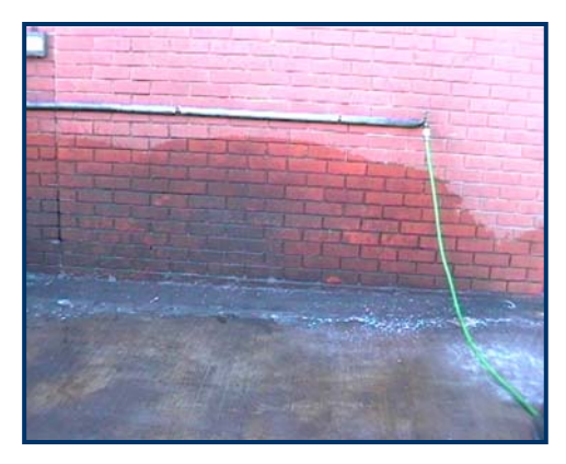
FleetKleen was also used on brick