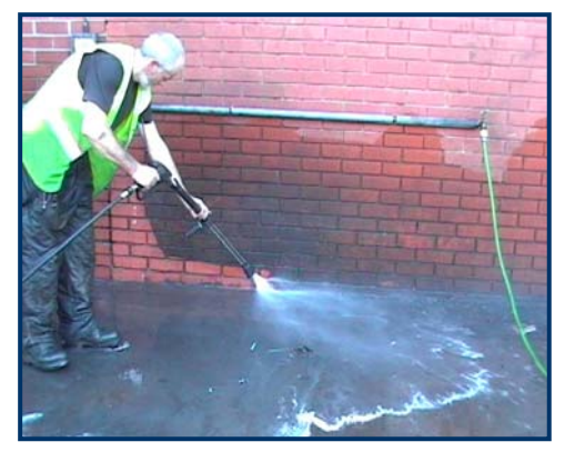
FleetKleen works on all solid surfaces