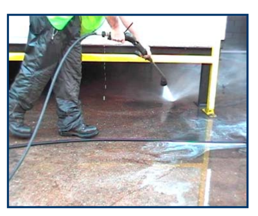
Once clear, the second clean down with pressure lance can commence