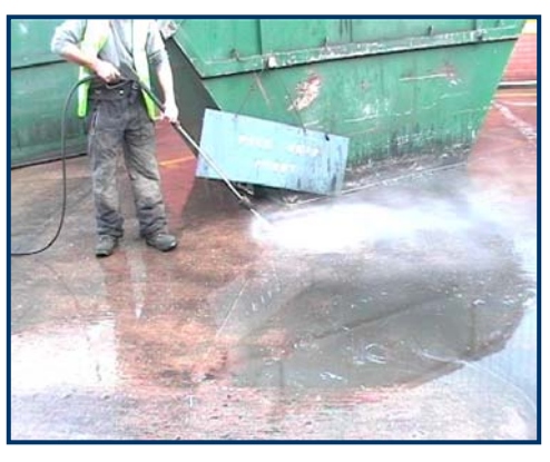
Pressure lance cleaning